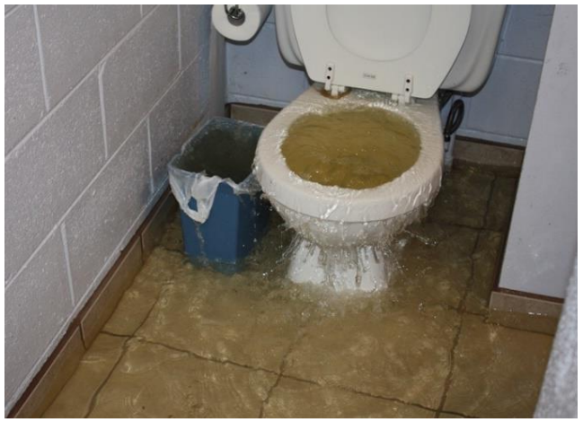
PRACTICES RESIDENTIAL SANITARY SEWER USERS